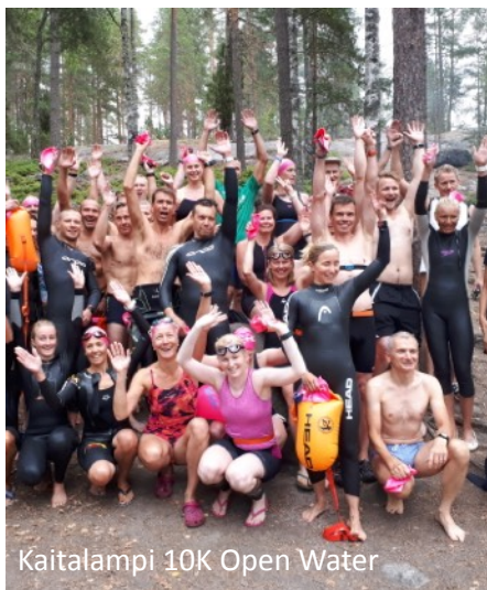
Kaitalampi 10K Open Water