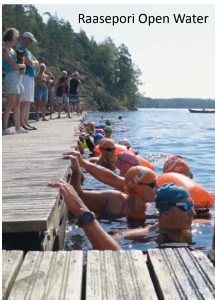
Raasepori Open Water