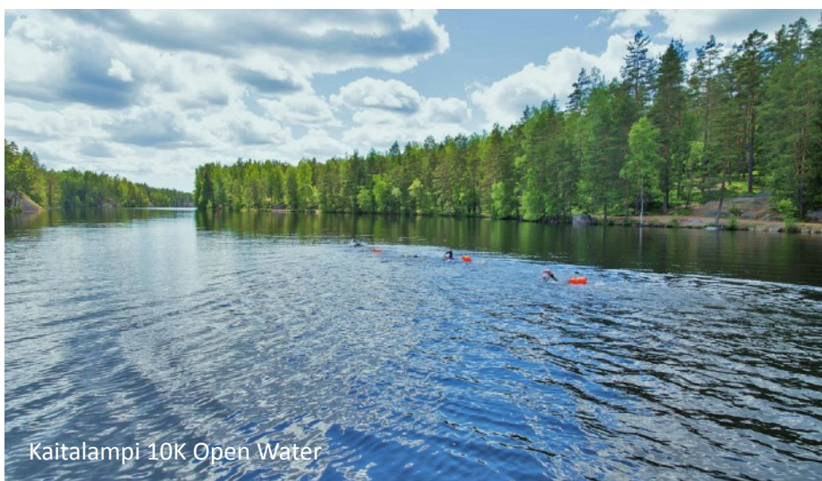
Kaitalampi 10K Open Water